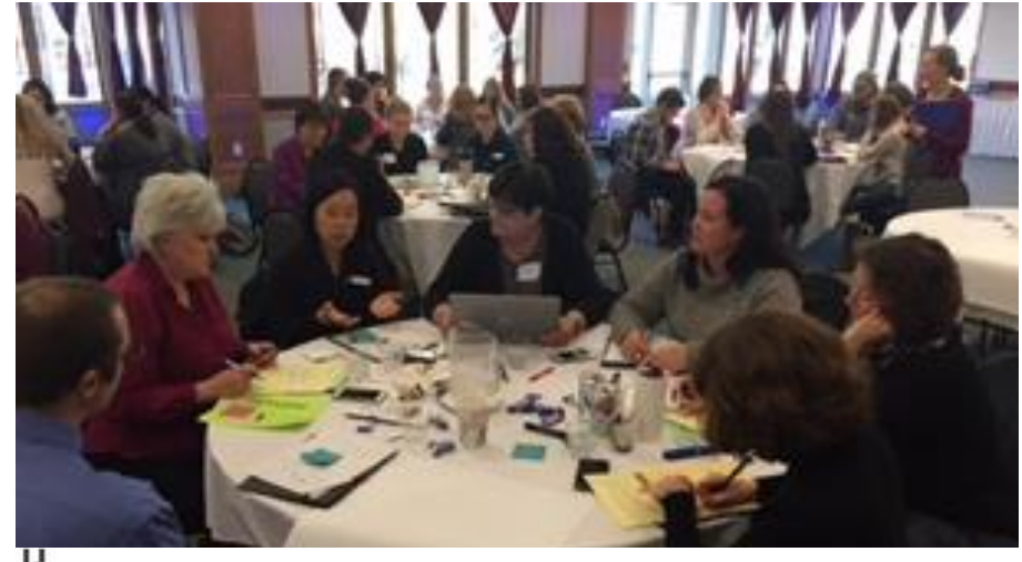
Participants in discussion at the 2016 Mental Health Summit