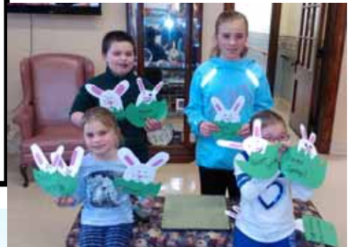
New members from Woodland Workers visited the Ashland Health Care facility and handed out these decorations for residents' rooms.