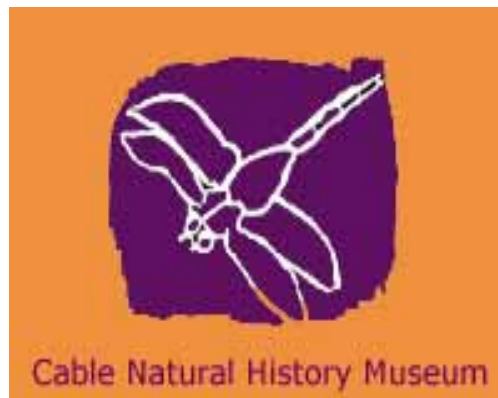
Cable Natural History Museum

Clue: This is always a fun place to play if you are out and about in the country for the day!