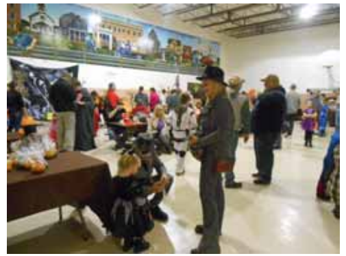
Community Halloween Party put on by Ino Valley at the Benoit Community Center Oct. 29