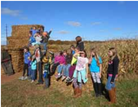
Ino Valley members getting ready to travel to the corn maze. It was a very large maze, on hills and turns and good thing we could see the farm buildings, otherwise we were in for a long, lost walk. Thanks to the White River Ag farm for providing us with a great day of safe fun.