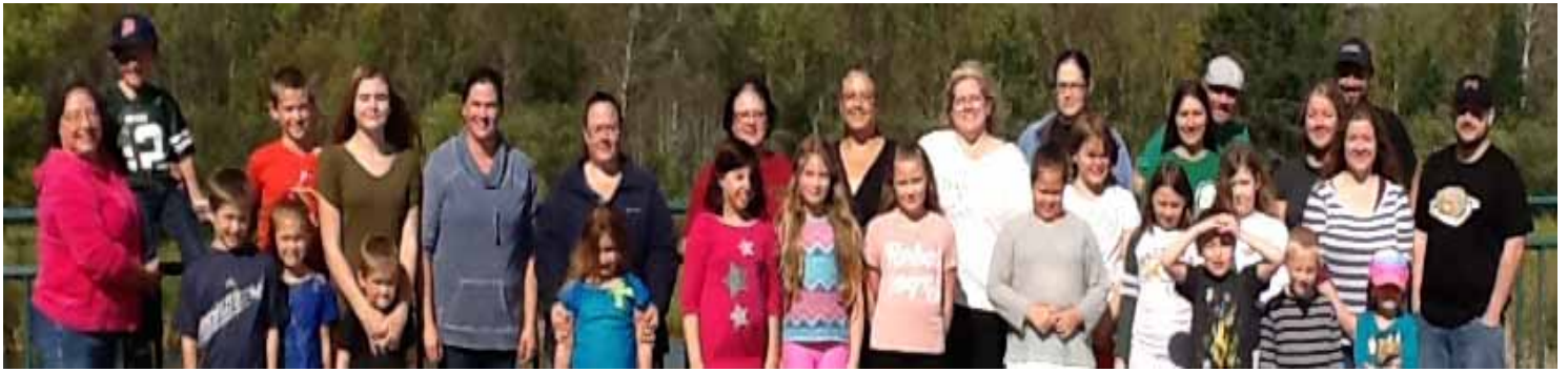
Ino Valley 4-H Club members, leaders and parents at the enrollment meeting held at the Great Lakes Visitor Center.