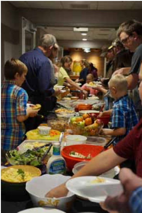
A delicious, plentiful, and colorful potluck meal was enjoyed by all