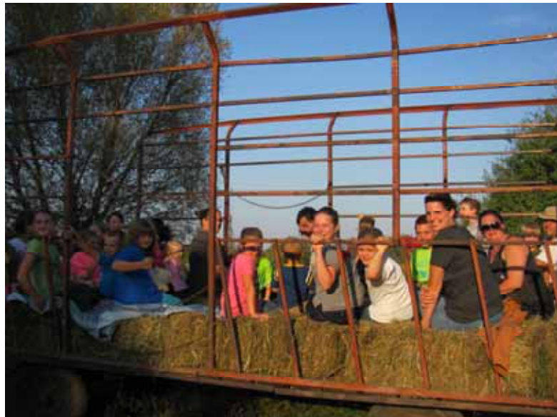
Gitche Gume 4-H Club