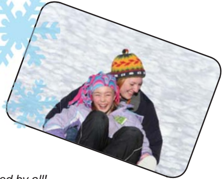
Inside or out, Winter Fun Day was enjoyed by all!

Calling all Jr. Leaders in Burnett County for an AMAZING RACE! (Sixth graders are also invited). Registration deadline is April 18th - we need to know who you are, what grade you are in, what club you belong to and if you are bringing a friend. It is important we know how many participants there will be!