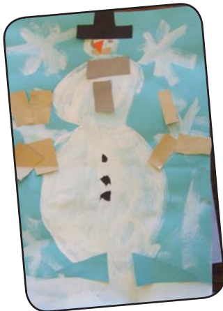
Pictured: Entries in the Demonstration, Arts & Crafts, Drama, and Photography divisions.