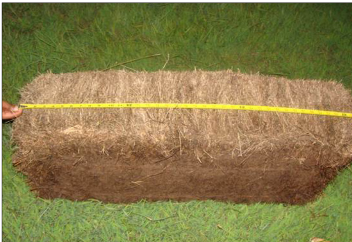
Figure 1. Position the bale so that the baling twine is parallel to the ground. The yellow tape was used to measure the dimensions of the bale.

A straw or hay bale garden is a gardening method used for raising vegetables, herbs, and flowers directly on a bale. Straw or hay bales from alfalfa, wheat, oats, rye, or other cereals are suitable for making a garden bed. Straw bales are preferable over hay because hay bales contain more weed and grass seeds. The bale should be tight and held together with 2-3 strands of plastic baling twine—preferably made from a biodegradable material such as jute and sisal (Figure 1). Biodegradable twines should be positioned parallel to the ground to avoid their hastened decomposition.