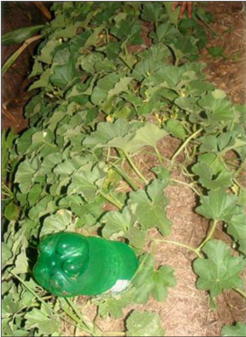
Figure 4. Pierce the lid of a plastic bottle, fill with water, secure lid, set bottle upside down into the bale to provide drip irrigation.

ture. Temperature affects how quickly the plants take up the available water. Liquid organic nutrients can be added to the water.