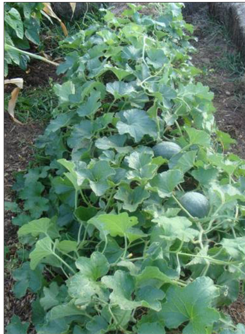
Figure 2. Cantaloupe grown on straw bales.