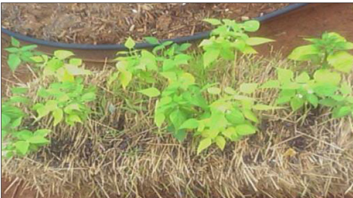
Figure 5. Nitrogen deficiency in pepper.

Adequate nutrient supply is critical for plants growing in bales. Make sure that plants have a sufficient supply of the major nutrients nitrogen, phosphorus, and potassium throughout the season. Nitrogen deficiency is very common in straw bale beds because the microbes are using much of the available nitrogen to break down the bale, and nutrients are lost from leaching. If the oldest leaves begin to turn yellow before their physiological maturity, this is an indication that nitrogen may be limiting (Figure 5). Purpling is a symptom of phosphorus deficiency, while leaf margin necrosis (brown leaf edges) is a symptom of potassium deficiency.