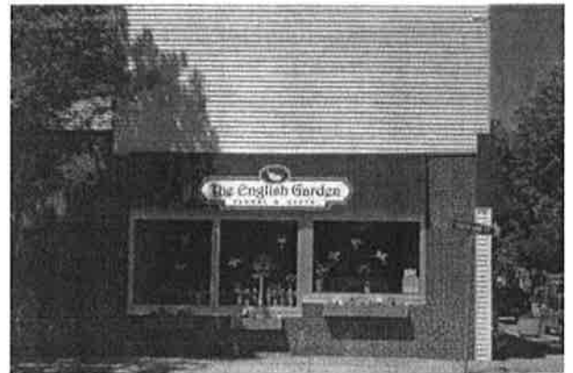
A unique downtown business

Yes, they are very close to the Madison area. Large schools, good shipping lanes out of town.