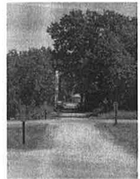
The Bike Trail

Comments: It's hard to comment when there doesn't seem to be one.