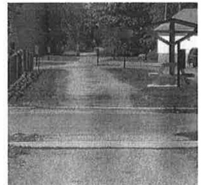
The Bike Trail