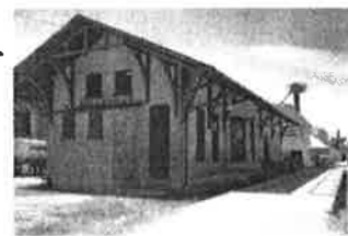
Old Railroad Depot

Unfortunately I would not. Just not enough going on there. Not enough shops.