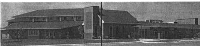
A new church building

Observations: Good mix of old/new & apartments.