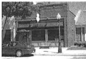
Renovated Building in Downtown Area

Average Team Score: 1, 3 (3) Limited signage, the building in the park was not marked in any way, still wonder what that was. Beautiful building. None