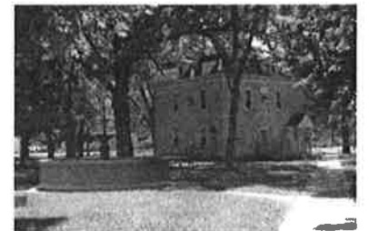
Historic Home in downtown park