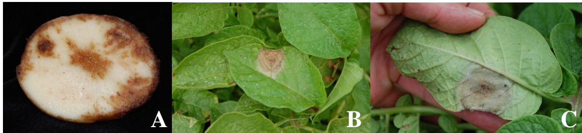
Figure 1. Symptoms of late blight on potato tuber and leaves. A. Note brown-rust colored firm discolored tuber tissue. B. Late blight lesion on potato leaf. Lesions appear brown and papery when weather turns dry or after fungicide use. C. Underside of leaf showing late blight pathogen producing spores.

Disease Description & Status of Disease in WI: Late blight is a potentially destructive disease of tomatoes and potatoes caused by the fungal-like organism, Phytophthora infestans . This pathogen is referred to as a ‘water mold’ since it thrives under wet conditions. Symptoms of tomato or potato late blight include leaf lesions beginning as pale green or olive green areas that quickly enlarge to become brown-black, water-soaked, and oily in appearance (Figure 1). Lesions on leaves can also produce pathogen sporulation which looks like white-gray fuzzy growth (Figure 1, 2). Stems can also exhibit dark brown to black lesions with sporulation. Fruit symptoms begin small, but quickly develop into golden to chocolate brown firm lesions or spots that can appear sunken with distinct rings within them (Figure 2); the pathogen can also sporulate on tomato fruit giving the appearance of white, fuzzy growth. The time from first infection to lesion development and sporulation can be as fast as 7 days, depending upon the weather. In WI, as in several other U.S. regions, late blight has been identified on tomatoes and potatoes in each of the last 6 years. On June 24, 2015, we confirmed late blight on potato in northern Adams County, WI. Since that time, 15 more WI counties have had confirmed late blight on tomatoes and/or potatoes. It is important to protect susceptible crops with fungicides in both conventional and organic production systems.