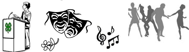
EXHIBIT WORK DAY – APRIL 29

The Performance Arts Festival will be held on Saturday, April 29 from 8am-3pm, at the CAL Center 1100 S. Albert Ave, Reedsburg. The Performance Arts Festival includes vocal, instrumental, and dance performances, as well as drama and speaking performances. We encourage all of our 4-H members, leaders and families to attend, enjoy the performances, and support all of the performers.